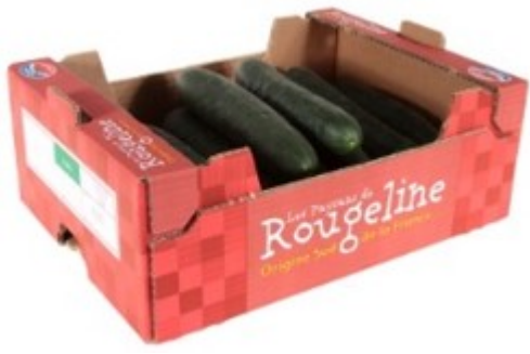
Colis - 5kg